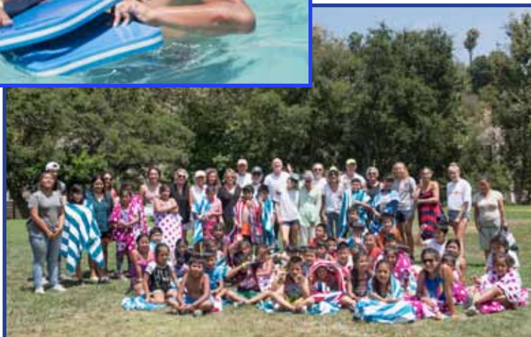
Las Familias Picnic