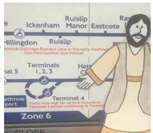
Right: Flat Jesus travelled to England with the St. Matthew's Choir last summer.

If your children are fans of Flat Stanley , then your family will love Flat Jesus. Flat Stanley is a children's book character who loves travel and geography since he can be mailed anywhere in the world like a postcard. Pick up your Flat Jesus in the narthex to decorate (or download from www.stmatthews.com ) and take him around the world on your travels this summer! Then be sure to post photos of his summer travels with you on our Facebook page (Parish of St. Matthew) - or to @stmatthewspali on Instagram. We can't wait to see your photos!