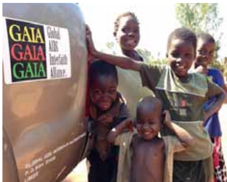
Above: Photo courtesy of GAIA.

St. Matthew's will travel to Malawi next summer to see the amazing work of GAIA up close. The trip will include two full days in Mulanje District observing MHCs and community programs in action and two days in Blantyre to visit Kamuzu College of Nursing, the main office, and the Ellen Schell building funded by David Miller.